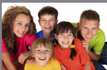
> Puberty – Normal or Not?