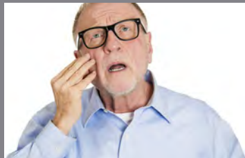
> Memory Loss