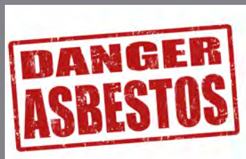
> Asbestos Exposure