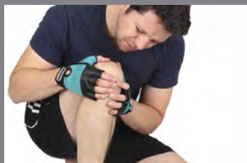
> Shin splints